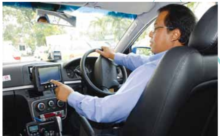
(left) EMAS for major arterial roads. (right) Intelligent taxi despatch system

two-way messaging. It is suitable for commercial, emergency and security applications involving fleet management, asset tracking, remote data collection, vehicle recovery and emergency assistance.