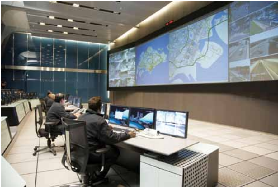
Transport control centre

realtime traffic information for motorists for better route planning. It also generates response plans for relevant agencies to enhance their incident management efforts and monitors the operational status of all on-site and tunnel equipment for integrated resource management.