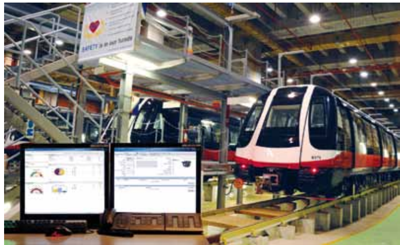
(left) Platform screen door system. (right) Maintenance management system

display subsystems. The integrated surveillance and alarm subsystems also ensure a safer ride for passengers on-board.