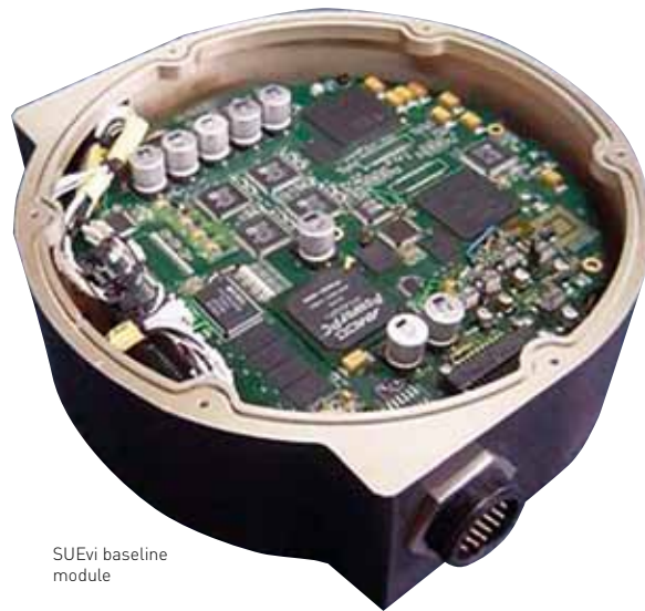
SUEvi baseline module

As illustrated in the diagram (opposite page), the SUEvi module is capable of acquiring video data streams from