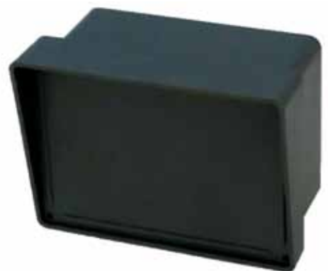
GS60 Radar Speed Detector

Other than vehicles on public roads, the Radar Speed Display detects speeds of trucks, forklifts or other work vehicles in factories, as well as speed calming for railways, waterways, airports, work sites, hospitals, campuses, school zones, neighbourhoods, military bases, industrial parks, national parks and recreational areas where unintended speeding is a concern.