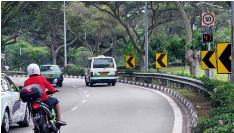
Radar Speed Display on Singapore Road

ST Electronics' PX168 Radar Speed Display enhances road safety