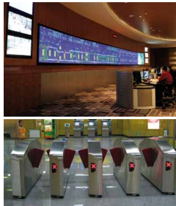
[top] ST Electronics' rail solutions. [top right] C3 control centre. [bottom right] Automatic fare gate system

China, Taiwan, the Middle East, Turkey and as far-flung as Brazil.